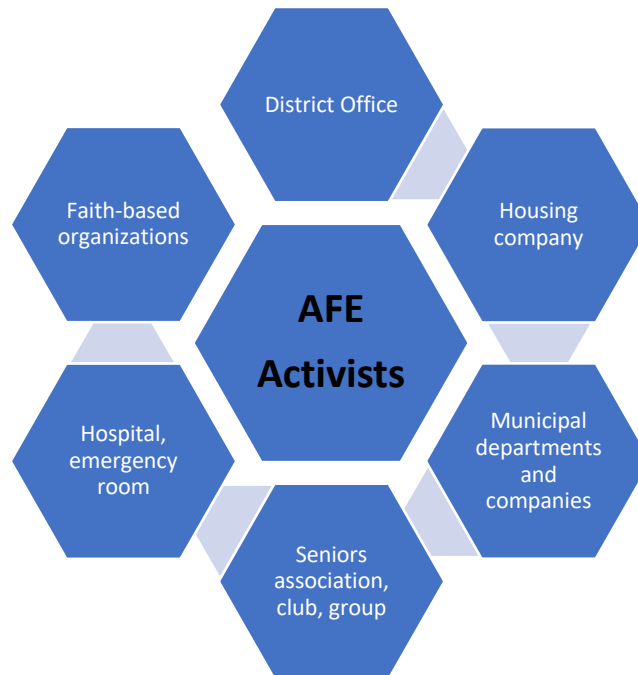
Figure 1 Stakeholder categories

Stress the brainstorming aspect of the activity so that as many stakeholders as possible are identified in order to shortlist the most feasible stakeholders for the project. Ask the participants to search (at home) the organizations/institutions mentioned for actual people who could be contacted for further stakeholder engagement.